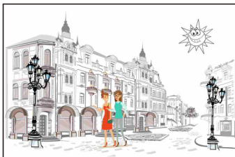
With sufficient natural light, the light does not switch on whether presence is detected