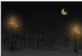
With insufficient natural light, the sensor switches on the light automatically